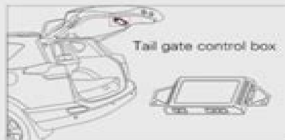
Tail gate control box