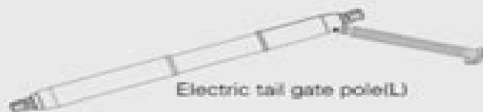
Electric tail gate pole(L)