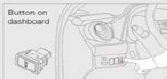
Button on dashboard