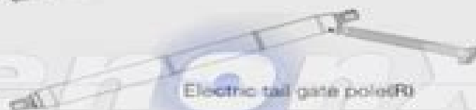
Electric tail gate pole(R)