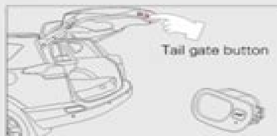
Tail gate button