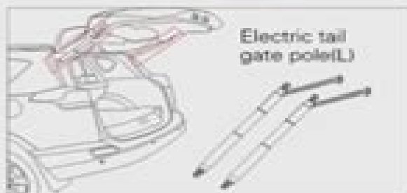
Electric tail gate pole(L)