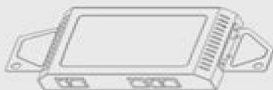
Tail gate control box