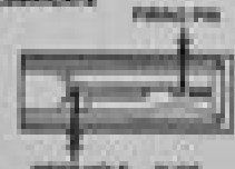
STOP HOLE SLIDE