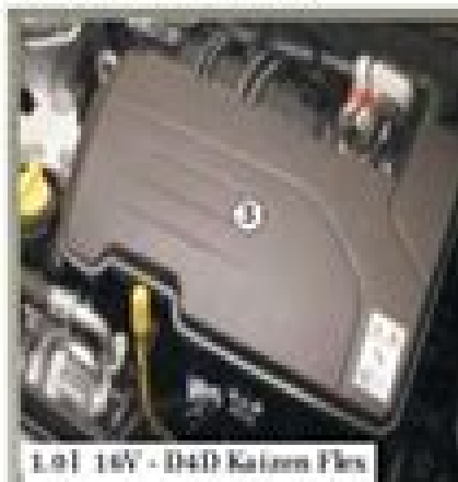
1.0 I 16V - D4D Kaizen Flex

Libere a lingueta 1 e, em seguida, gire ligeiramente a tampa 2 no sentido anti-horário para estralá-la. Substitua o elemento filtrante e reponha a tampa.