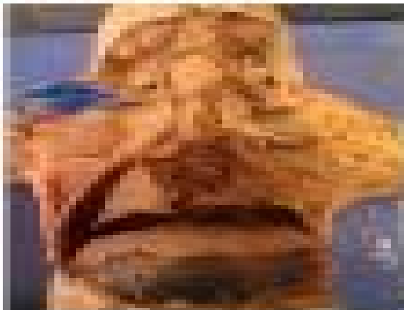
Fig. 2.1. Anatomy