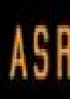
ASR indicator light