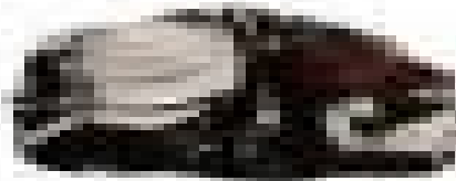
Photomicrograph of diorite.