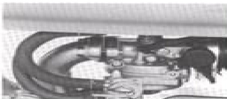
The carburetor identification number is stamped on the carburetor body left side.