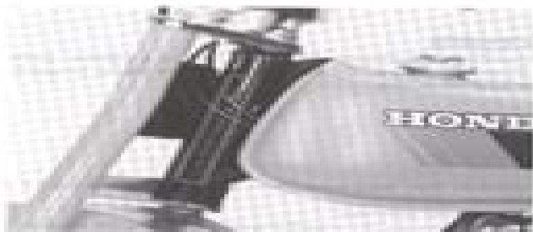
The frame serial number is stamped on the swing fork left side.