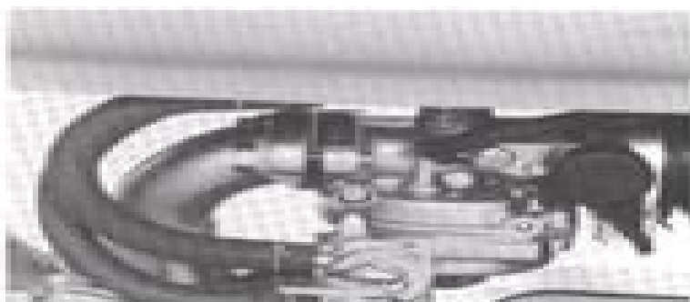
The carburetor identification number is stamped on the carburetor body left side.