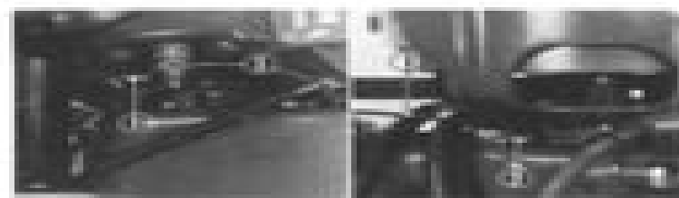
Fig. 4-84 (1) Primary wire (2) Terminal (3) Lock pin