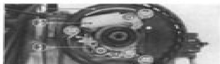
Fig. 4-87 (1) Advance case (2) Contact breaker (3) Condenser