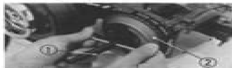
Fig. 4-85 (1) Flywheel puller handle (2) Cam pulley