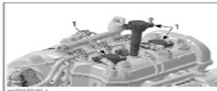
1. Ignition coils

Three direct ignition coils receive power from the fuse F3 through the relay.