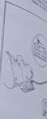
Page 100 of 100