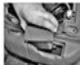
11.44a Remove the wiring

39. Ensure that the cylinder head mounting flanges are in place in the cylinder block, then fit the new cylinder head gasket over the downer (see illustration). The gasket can only be fitted one way, with the bolt to determine the gasket thickness at the front (see illustration 11.44). Then use it to avoid damaging the gasket's rubber coating.