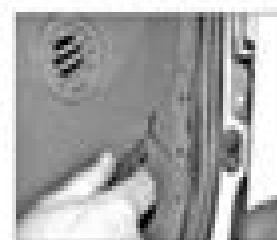
11.46e Using a small screwdriver, release the bolt covers from the face on both sides