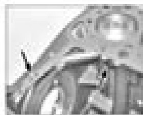
11.41 Tighten and hold in the gasket (previously, which indicates the gasket's thickness