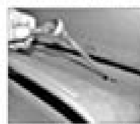
11.46b Then remove the four upper retaining bolts

47. Under the four outer mounting bolts from the face on both sides (see illustration).