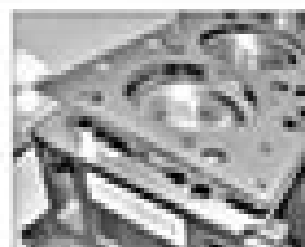
11.43 Locate the new cylinder head gasket over the downer correctly

16. If the same face as the old one. Measure the required gasket, and proceed to step 20.