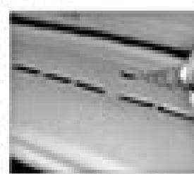
11.46a Lift off the two covers

both covers from the face on both sides (see illustration).