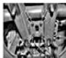
11.46c Under the six bolts (previously) securing the head, insert the support (shown) in the block