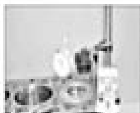
11.42 Using a feeler blade to measure the gasket protrusion