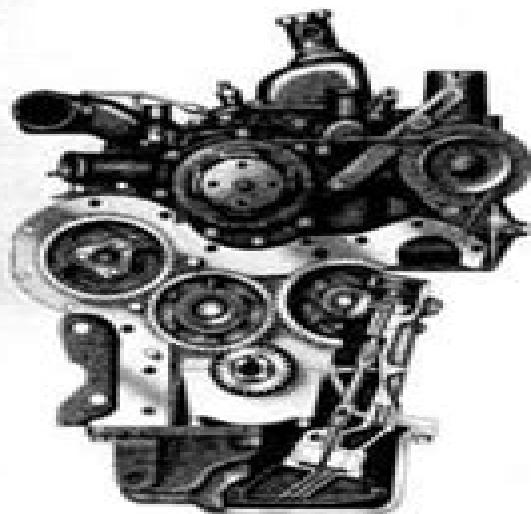
Figure 3 4-Cylinder Diesel Engine Sectional View