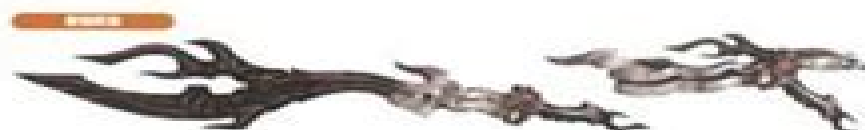
Sword of the Dawn