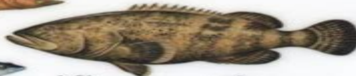
Jewfish Epinephelus microdon 308-44 kg - 680 lbs