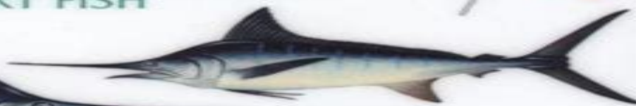
Striped Marlin Makaira rayado 2.24-10 kg - 4.94 lbs