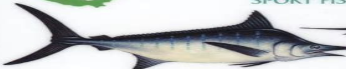
Blue Marlin Makaira australis 6.24-9.4 kg - 13.75 lbs