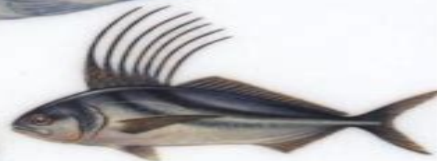
Moorish Muraena pinnatifida 51.7 kg - 114 lbs