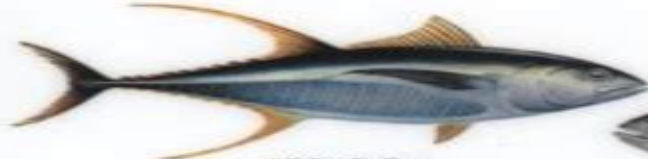
Yellowfin Tuna Thunnus albacares 176-35 kg - 388 lbs-12 oz