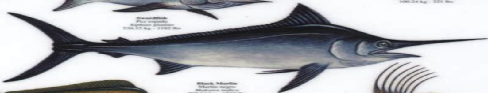
Black Marlin Makaira nigra 707-6.1 kg - 13.60 lbs