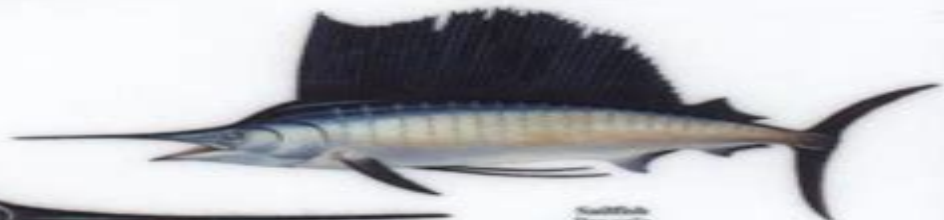
Sailfin Istiophorus platypterus 100-24 kg - 2.2 lbs