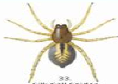
33. Silk Cell Spider Clubiona corticalis 8 mm