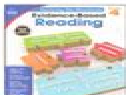
Applying the Standards: Evidence-Based Reading CD-104833

Check out these other great Carson-Dellosa products to support standards-based instruction in your classroom.