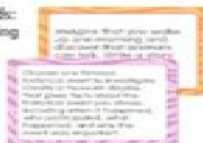
Curriculum Cut-Outs Story Starters CD-120488 CD-120491