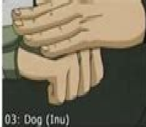
03: Dog (Inu)