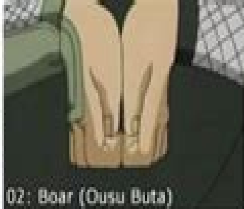
02: Boar (Osu Buta)