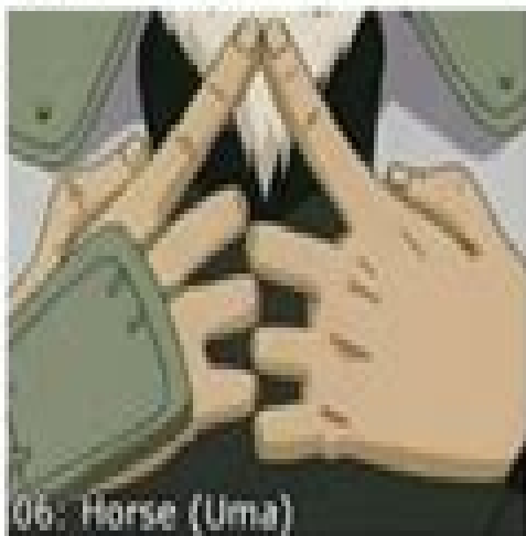
06: Horse (Uma)