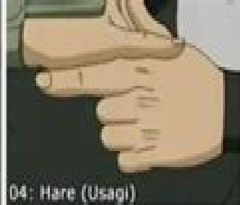
04: Hare (Usagi)