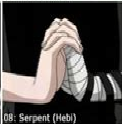
08: Serpent (Hebi)