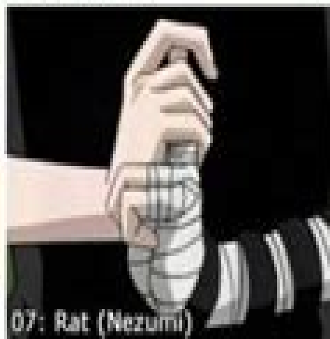
07: Rat (Nezumi)