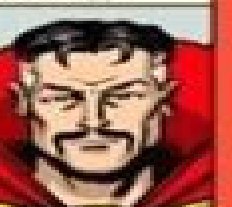
Unit 1: The History of the English Language