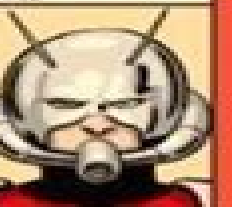
UNIT - BARRIERS