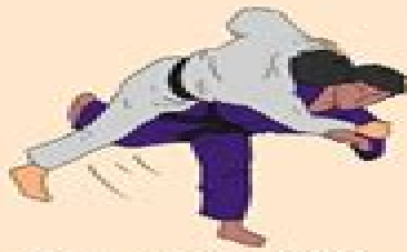
UCHI MATA (内股)