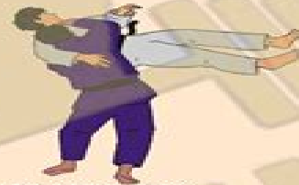
USHIRO GOSHI (後腰)