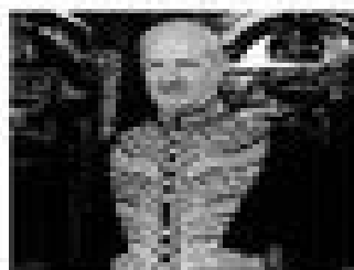
Governor of Alberta

From the page 1, be sure to use your writing. Be sure to use your news article on page 1.