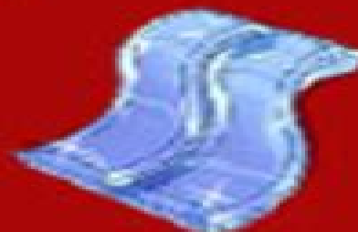
1 River Ripple