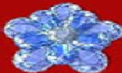
1 Rainbow Flower