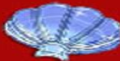
1 Sea Stone