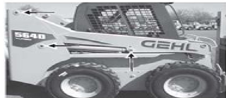
Fig. 3-10 Grease fitting locations.