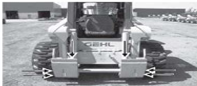
Fig. 3-9 Grease fitting locations.