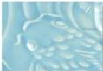
LG-24 [TP] Light Blue