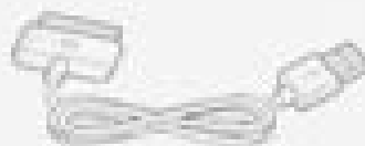
Dock Connector to USB Cable

10W USB power adapter: Use the 10W USB power adapter to provide power to iPad and charge the