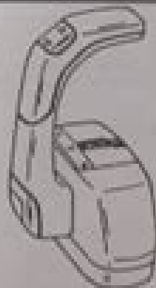
COMMANDER 3000 SINGLE HANDLE CONSOLE MOUNT REMOTE CONTROL