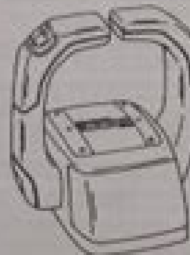
COMMANDER 3000 DUAL HANDLE CONSOLE MOUNT REMOTE CONTROL