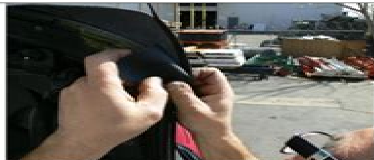
Step 26: FRONT CORNER FLAPS. After five minutes dry time attach corner to frame.