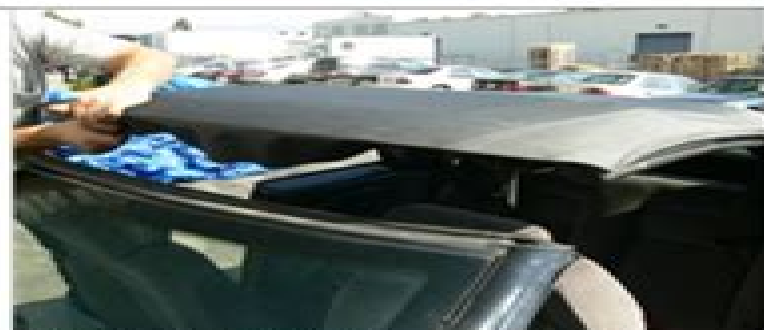
Step 28: TRIM EXCESS After dry time attach together equally and trim off excess material.