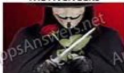
V FOR VENDETTA