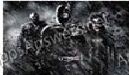
THE DARK KNIGHT RISES