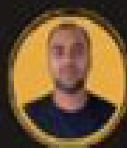
NSC GOLD MEDALIST