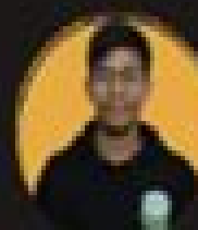
JRF 1ST RANK