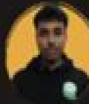
JRF 2ND RANK