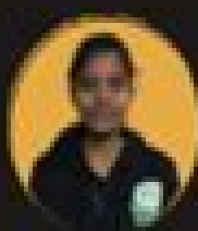
JRF 6TH RANK(CAT)