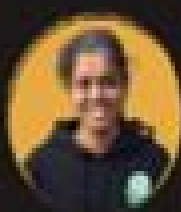
SRF 2ND RANK