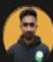
SRF 1ST RANK