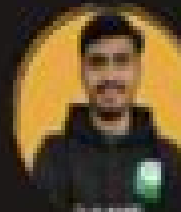
JRF 3RD RANK