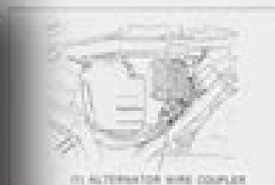
13 ALTERNATOR WIRE COUPLER

Route the alternator cable properly, secure it with clamps and