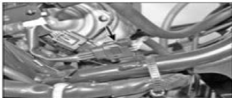
4.9c CKP sensor connector (arrowed)...