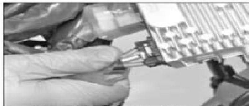
4.9d ...and alternator connector – 2010-on models