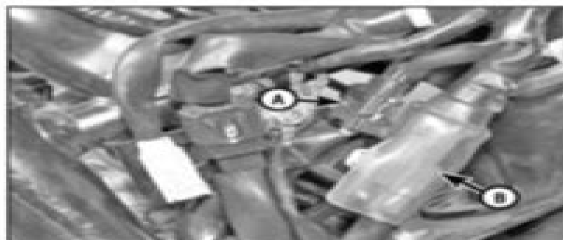
4.9b CKP sensor connector (A), alternator connector (B) – 2010 model shown