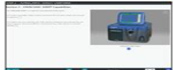
Operator Course Screen