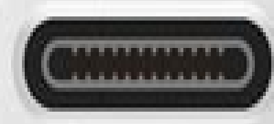
USB Type - C