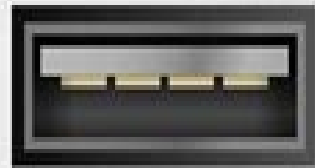
USB Type - A