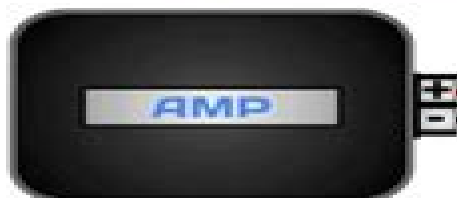
1 ohm stable mono bass amp

Maximum amp power: A DVC subwoofer can be used to get the maximum power from a 1 ohm stable amp by wiring two 2 ohm voice coils as a 1 ohm load.