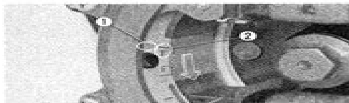
Fig. 1-11 ① Index mark ② "T" mark