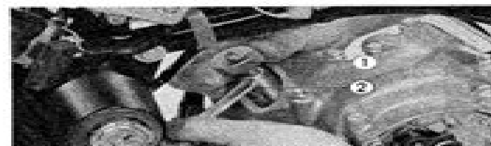
Fig. 1-12 ①, ② Tappet wrench (07908-3290000)

After installing a new valve guide, be sure to finish its inside surface with reamer (Tool No. 07984-2000000).