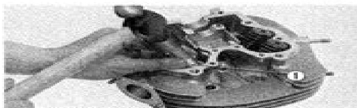
Fig. 1-9 ① Valve guide driver (07942-3290200)