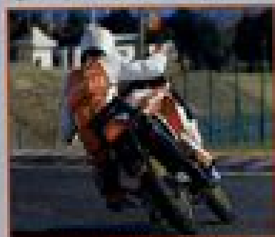
The Honda Fornicator is the most powerful in its class. Although it's been around since 1980, it still remains as good as the first.

“For 2000 just the original concept remains the same”