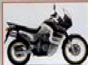
In 1980 the Fornicator gained 1 hp in power, making it the most powerful in its class.