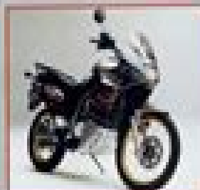
At 1981 the Fornicator was changed to give the 1981 model a new look, with a new engine, and a new design.