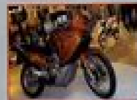
Honda created a heavily modified version of the Fornicator for the year 1983.

The 1983 model was the first to have a new engine, and a new look, with a new engine, and a new design.