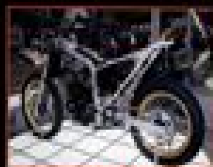
After a year, Honda's XL600V was changed to the XL600.

1980 1981 1982 1983 1984 1985 1986 1987 1988 1989 1990 1991 1992 1993 1994 1995 1996 1997 1998 1999 2000