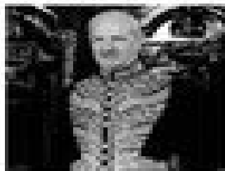
Member of the Cree Nation

Here is page 1 to give you writing. Begin writing your news article on page 2.