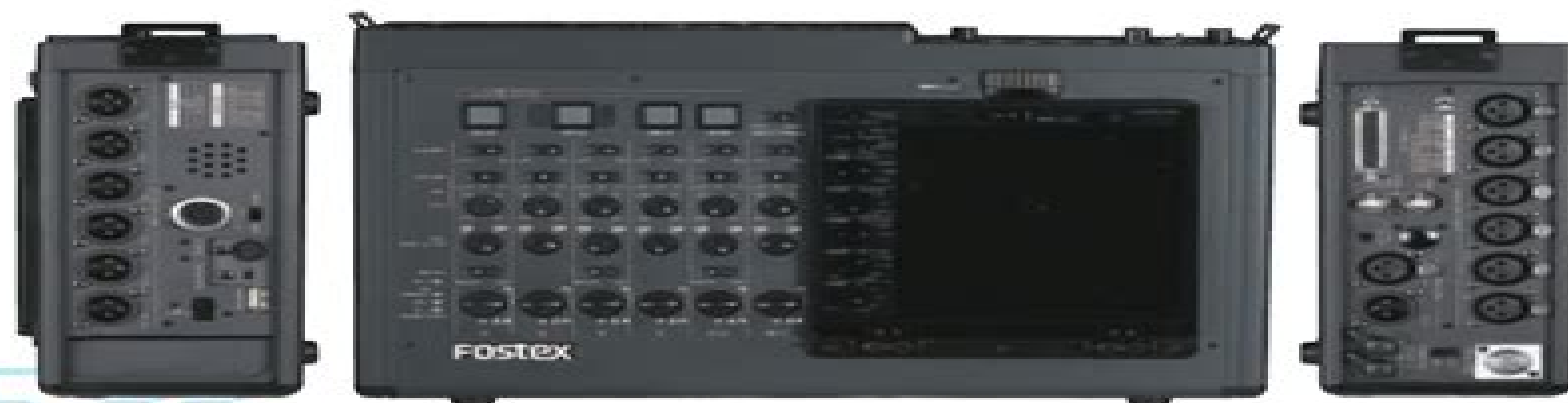
DVD LOCATION RECORDER WITH TIMECODE

not only simple stereo mixing of all six channels, but also by using a combination of the mixers, parallel mix signals tracks can be made whilst recording of either five tracks (mono guide track) or four tracks (stereo guide track). We call these "3+3" and "2+4" recording modes as separate 50% files are created. Additional features such as PFL monitoring and peak led indication on each channel complete this very flexible mixer.