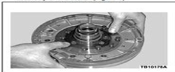
Figure 3 - Article 11-8-4

17. Loosen all 11 pump body to pump assembly fasteners and carefully push down on the loosened fasteners to remove pump and gear assembly and discard. (Figure 3)