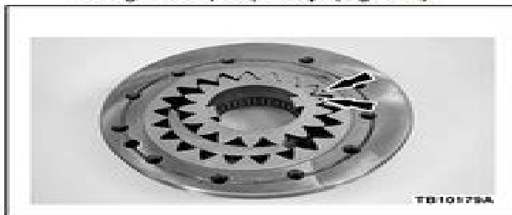
Figure 4 - Article 11-8-4

a. Verify both inner and outer gears have the Dot facing up on the new pump body and gears. Use care to keep pump gears from falling out of pump body. (Figure 4)