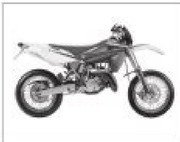
sm 125 s

Qui non direttamente qualificati dall'è la presenza di intentiono valid per tutti i modelli. stessa-offerire specific, data antiche non si al modello. Si non non specific, per dormire al lei prescrizione di relazione a tutti le macchine.