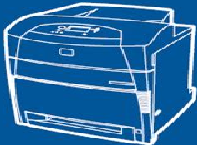
HP color LaserJet 5500/5550 Printers