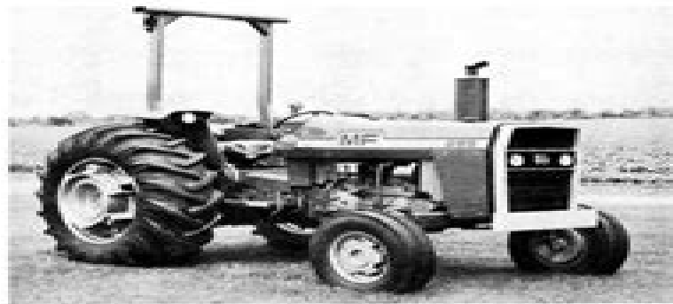
MF 285 TRACTOR