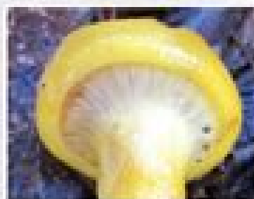
Dermocybe Canaria ? Yellow, slimy,