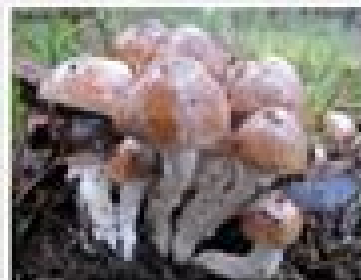
Cortinarius sp2? web, Apricot, pink,