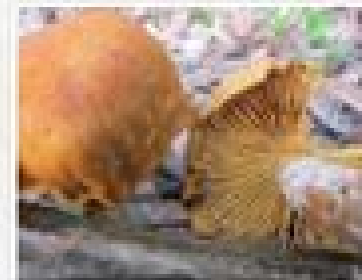
Cortinarius sp-6? web, mustard, ochre,