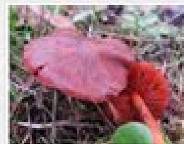
Dermocybe splendida : orange,