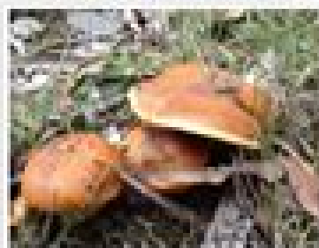
Cortinarius sp- 7?web, orange, mauve, wavy