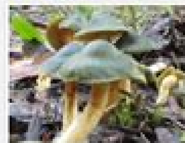
Dermocybe austroveneta - Oz, web, green, yellow,