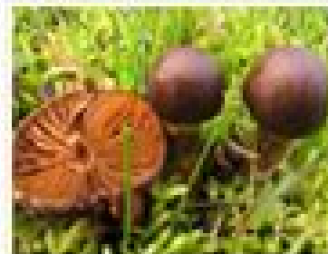
Cortinarius sp-4 Oz? web,brown,