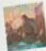
Color study: Warm tones. This study explores the use of warm colors in a landscape.