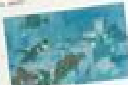
Color study: Cool tones. This study explores the use of cool colors in a landscape.

Study of color is a key element of painting. It is a way to explore the use of color in a painting. It is a way to explore the use of color in a painting. It is a way to explore the use of color in a painting.