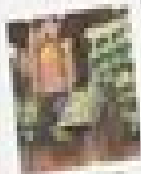
Color study: Warm tones. This study explores the use of warm colors in a landscape.