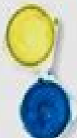
Color study: Cool tones. This study explores the use of cool colors in a landscape.