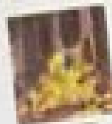
Color study: Warm tones. This study explores the use of warm colors in a landscape.