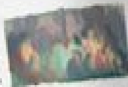
Color study: Warm tones. This study explores the use of warm colors in a landscape.

In addition to the color wheel (shown), you can make small color studies in the same manner as the final painting. Color studies are a good training ground for color combinations and overall design.