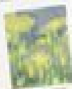
Color study: Warm tones. This study explores the use of warm colors in a landscape.