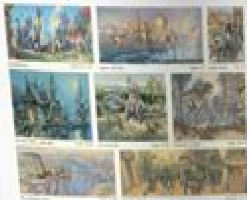
Color study: Warm tones. This study explores the use of warm colors in a landscape.