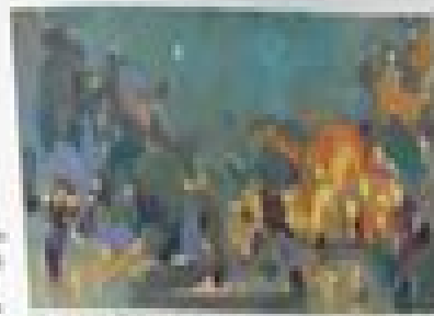
Color study: Warm tones. This study explores the use of warm colors in a landscape.

It is a way to explore the use of color in a painting. It is a way to explore the use of color in a painting. It is a way to explore the use of color in a painting.