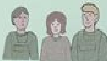
Protect members of the federal judiciary