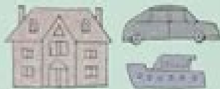
Manage and sell assets