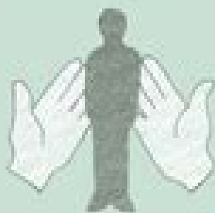
Protect federal witnesses