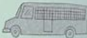
Transport and manage prisoners