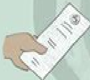
Serve court documents