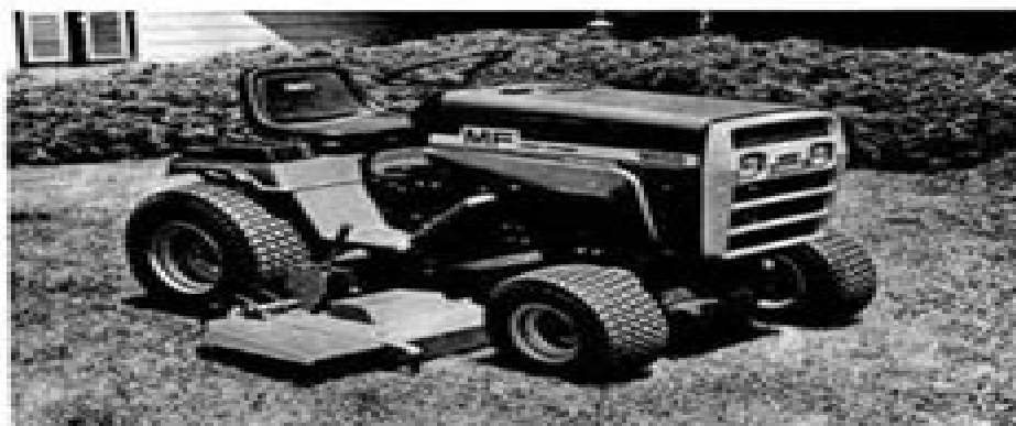
MF 1655 AND MF 1855 GARDEN TRACTOR WITH MOWER