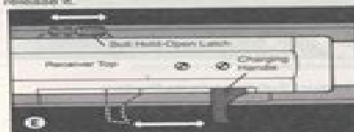
Push bolt hold-open latch forward.

Push the charging handle all the way back, and hold it there. To close the bolt from the manual hold-open position, remove the magazine and push the bolt hold-open latch as far forward as it will go (See E). Then, pull the charging handle back and release it.