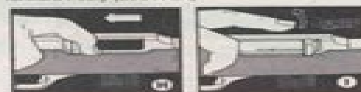
Pull charging handle all the way back.

With the safety on SAFE and the loaded magazine locked in place, the rifle in normal shooting position, and pointed in a safe direction, pull the charging handle all the way back and let it snap forward freely (See H & I).