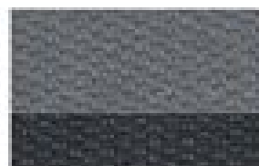
Medium Dark Flint Cloth

■ MEDIUM DARK FLINT ■ EBONY/RED ■ EBONY/BLUE ■ SOLID EBONY