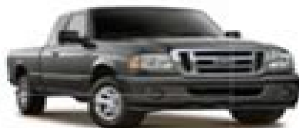
Dark Shadow Grey Metallic