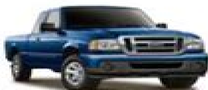
Vista Blue Metallic