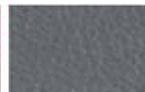
Medium Dark Flint Leather