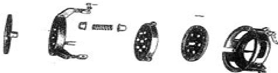
Fig. 86. - Clutch, exploded view.