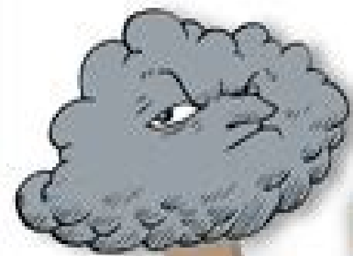
Cloud of Darkness